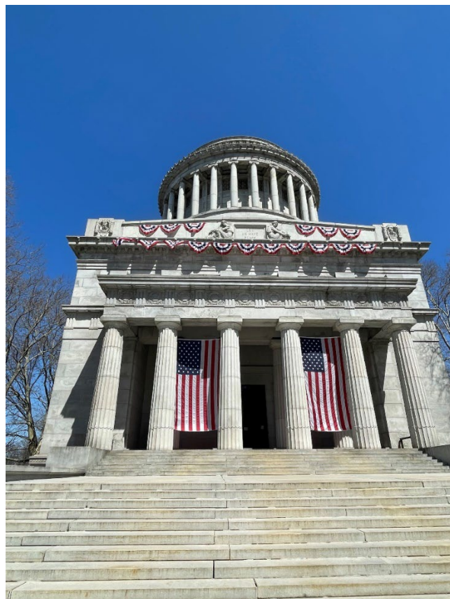
General Grant Nat'l Memorial

On the topic of legendary, the U.S. capital markets of 2023 have been extraordinary in six short months. We have witnessed the top five largest stocks by market cap size (Apple, Microsoft, Google, Amazon, and Nvidia; aka Megacaps) dominate and influence the overall YTD performance of the S&P 500 in an unprecedented way as they represent approximately 22% of the market weight within the S&P 500 Index. These five stocks accounted for roughly 80% of the 16% gain halfway through this year.