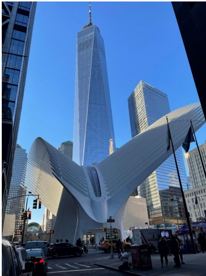
World Trade Center, NYC

Equity investors were supported by two factors during this period: reduced CPI inflation numbers and healthy corporate earnings reports. In June of the previous year, the 12-month CPI rate reached 9.0%, but the latest reading for May of this year was 4.0% (BLS Report June 13, 2023). Investors are optimistic that lower inflation numbers will allow the Federal Reserve to ease its high interest rate policies.